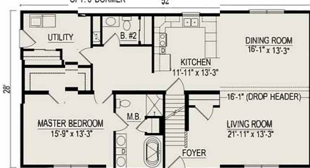
1st Floor Basement Plan

CALL MARTY (231) 463 3900 350 W. Wexford Ave. (M-37) Buckley, MI 49620